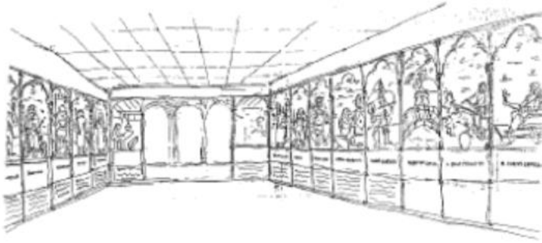
Figure 2-8. Reconstruction by Theodor Mommsen and Lilian Armstrong of the Sala Virorum Illustrium, Reggia Carrarese, Padua, 1370s. The room held thirty-six Roman leaders with eighteen figures on each side.