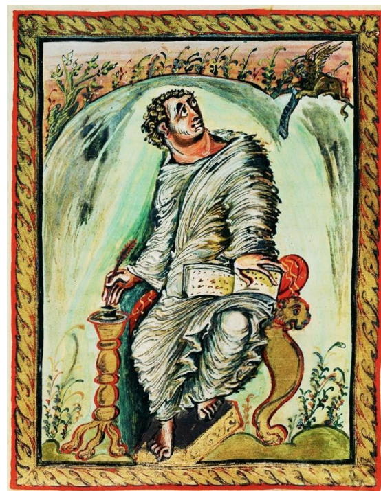
Figure 1-10. Saint Mark, Ebbo Gospels, c. 816-835, Hautvillers, France. (Bibliothèque Municipale, Épernay)