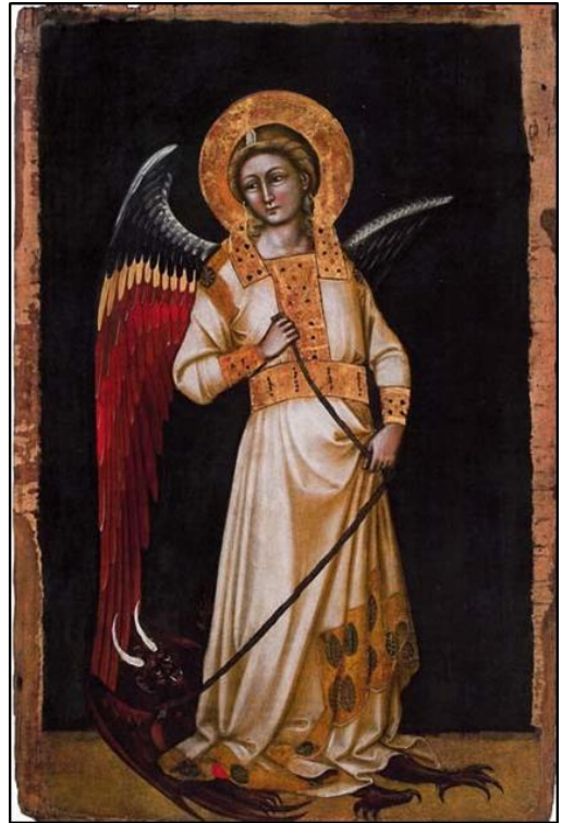
Figure 2-18. Guariento, Angel Holding Demon with Chain (Powers) , c.1347-50, Musei Civici, Padua (formerly chapel of the Reggia Carrara).