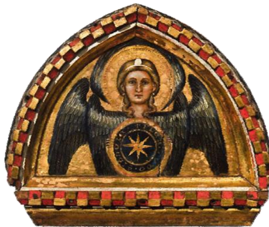
Figure 2-14. Guariento, Cherubim , c.1347-50, Musei Civici, Padua (formerly chapel of the Reggia Carrara).