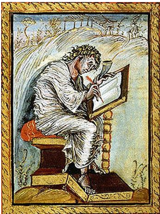
Figure 1-7. Saint Matthew, Ebbo Gospels, c. 816-835, Hautvillers, France. (Bibliothèque Municipale, Épernay)