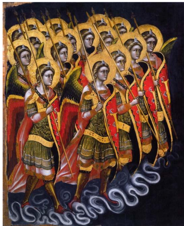
Figure 2-20. Guariento, Armed Band of Angels (Principalities) , c.1347-50, Musei Civici, Padua (formerly chapel of the Reggia Carrara).