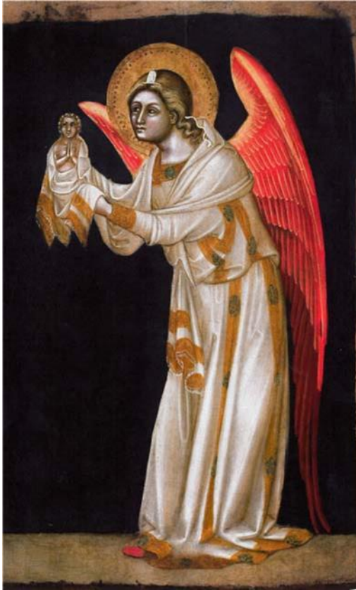
Figure 2-21. Guariento, Angel Holding a Soul ( Angels ), c.1347-50, Musei Civici, Padua (formerly chapel of the Reggia Carrara).