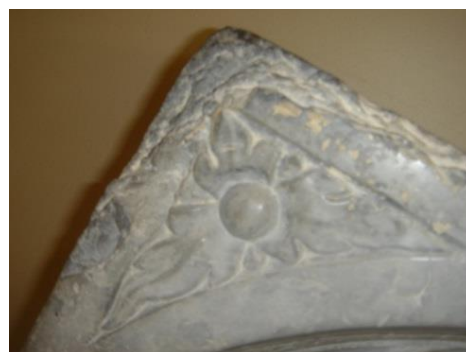
Figure 3-19 Flower detail, Tomb Relief of Pierre de Bauffremont, c.1453-72, Walters Art Museum, Baltimore, Maryland.