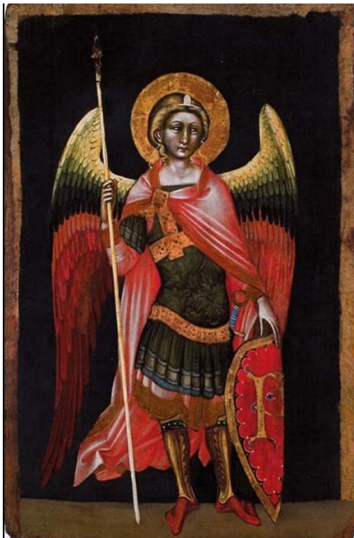
Figure 2-19. Guariento, Angel Armed with Spear and Shield (Principalities) , c. 1347-50, Musei Civici, Padua (formerly chapel of the Reggia Carrara).