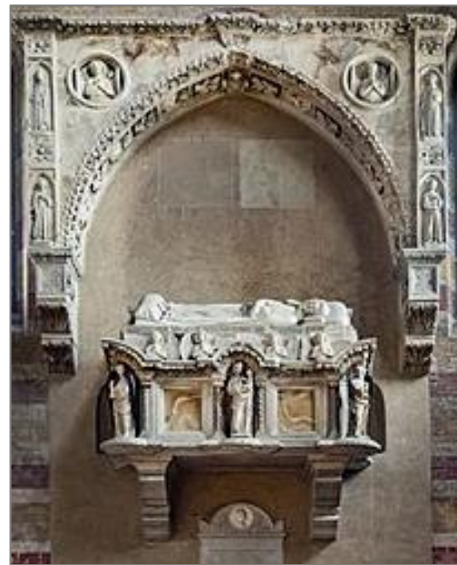
Figure 2-7. Tomb of Ubertino da Carrara, Church of the Eremitani, Padua, d. 1345 (originally Sant'Agostino).