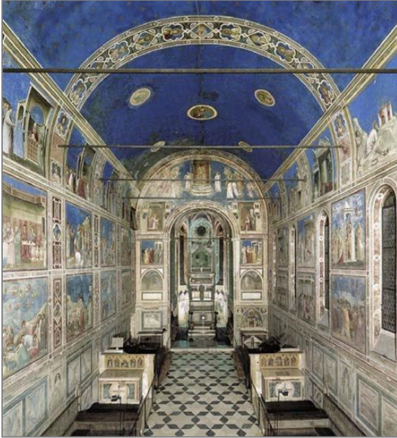
Figure 2-1. Arena Chapel, Padua, with The Last Judgment by Giotto over the door, c.1305.