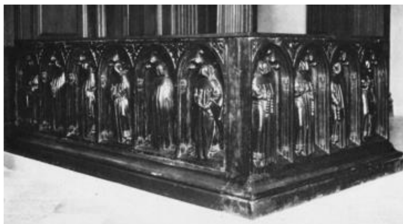
Figure 3-13. Tomb of Pierre de Bauffremont, c.1453-72), Musée des Beaux-Arts, Dijon.