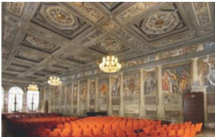
Figure 2-9. Domenico Campagnola and Stefano dall'Arzere, view of current condition, Sala Virorum Illustrium (Sala dei Giganti), 1540. Former Reggia Carrara, Padua.