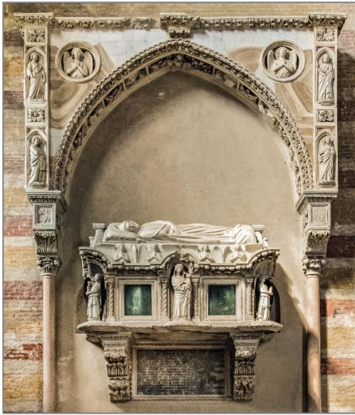
Figure 2-4. Tomb of Giacomo II da Carrara, Church of the Eremitani, Padua, d. 1350 (originally Sant'Agostino).