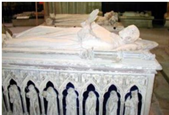
Figure 3-2. Tomb of Louis of France, d. 1260, Saint Denis Basilique, France.