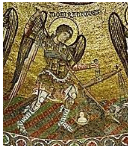
Figure 2-10. Dominaciones , Dome of the Angels of the Baptistery, San Marco, Venice, mid-1300s.