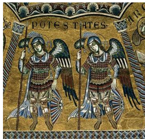
Figure 2-12. Potestates , Baptistery of Florence, mosaics from cloister vault, c.1240-1300.