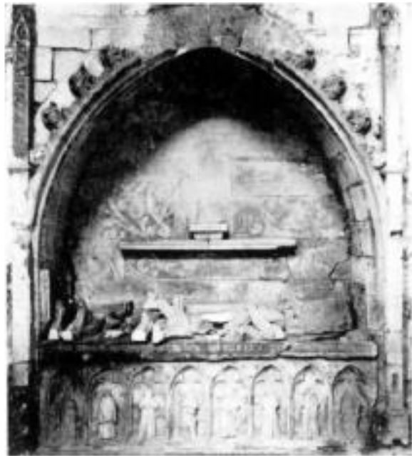
Figure 3-11. Tomb of Jacques Kastangnes, c.1327, Church of Saint-Quentin, Tournai.