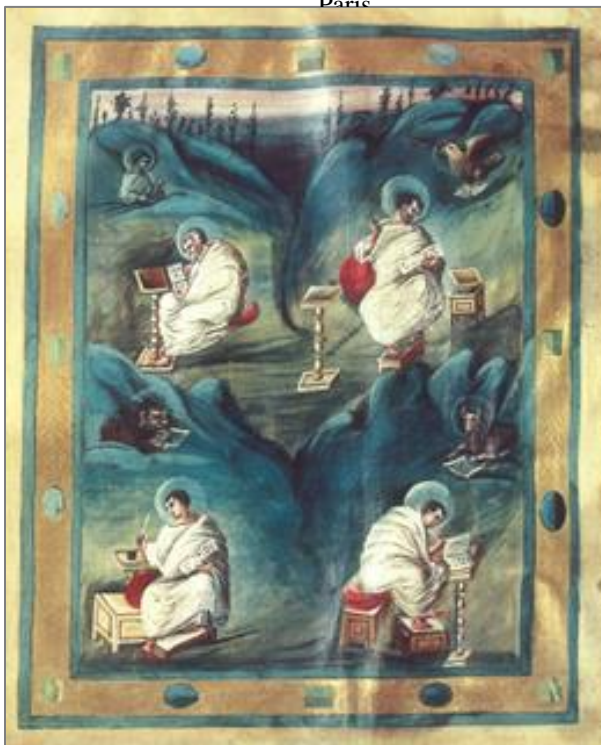
Figure 1-2. Aachen Gospels, c. 800-810.