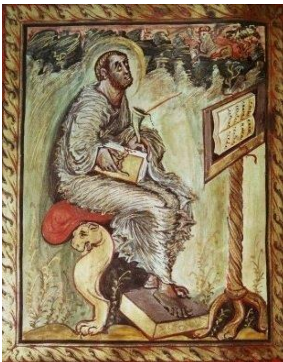
Figure 1-9. Saint Luke, Ebbo Gospels, c. 816-835, Hautvillers, France. (Bibliothèque Municipale, Épernay)