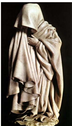
Figure 3-5. Mourner, Tomb of Philip the Bold, Duke of Burgundy, c.1381-1410 (Musée des Beaux-Arts, Dijon).