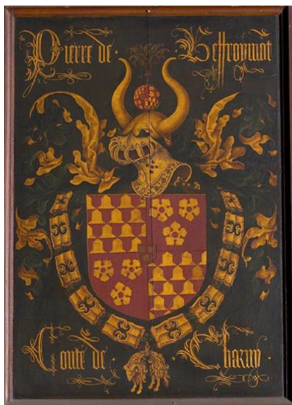
Figure 3-17. Coat-of-arms of Pierre de Bauffremont, formerly in the choir of the Church of Notre-Dame de Bruges (Chapter of the Golden Fleece of 1468).