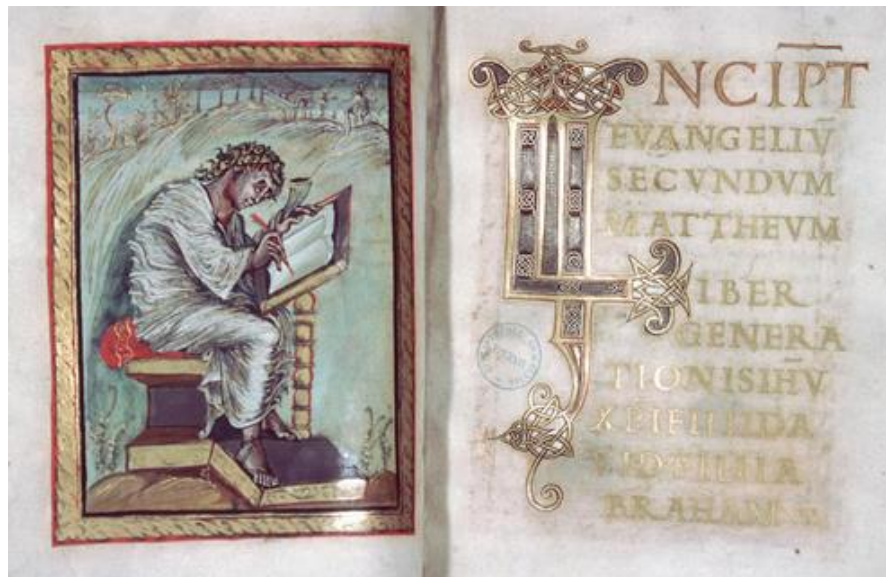
Figure 1-6. Incipit Page, Saint Matthew, Ebbo Gospels, c. 816-835, Hautvillers, France. (Bibliothèque Municipale, Épernay)