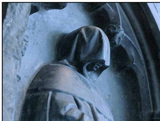
Figure 3-14. Mourner, Tomb Relief of Pierre de Bauffremont, c.1453-72, Walters Art Museum, Baltimore, Maryland.