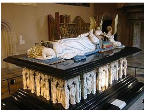
Figure 3-3. Tomb of Philip the Bold, Duke of Burgundy, c.1381-1410 (Musée des Beaux-Arts, Dijon).