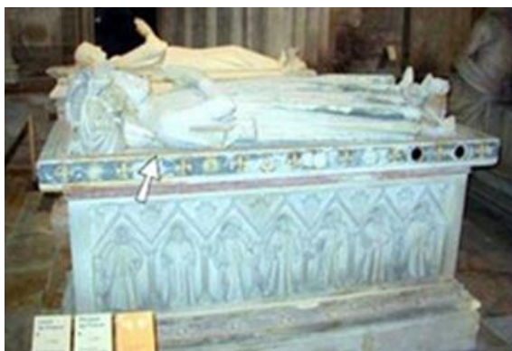
Figure 3-1. Tomb of Philippe Dagobert de France, d. 1234, Saint Denis Basilique, France.