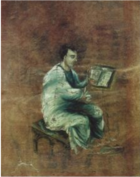
Figure 1-4. St. Matthew, Xanten Gospels, c.810.