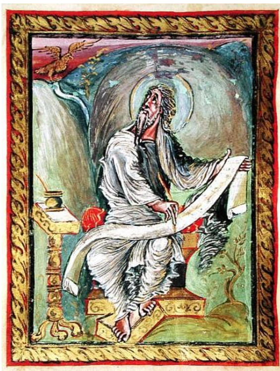
Figure 1-8. Saint John, Ebbo Gospels, c. 816-835, Hautvillers, France. (Bibliothèque Municipale, Épernay)