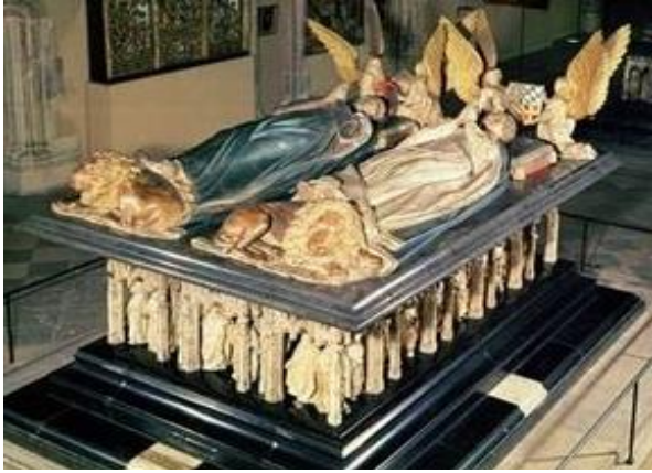
Figure 3-8. Tomb of John the Fearless, Duke of Burgundy, Musée des Beaux-Arts, Dijon, c.1443-1469.