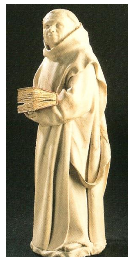
Figure 3-7. Carthusian monk, Tomb of Philip the Bold, Duke of Burgundy, c.1381-1410 (Musée des Beaux-Arts, Dijon).