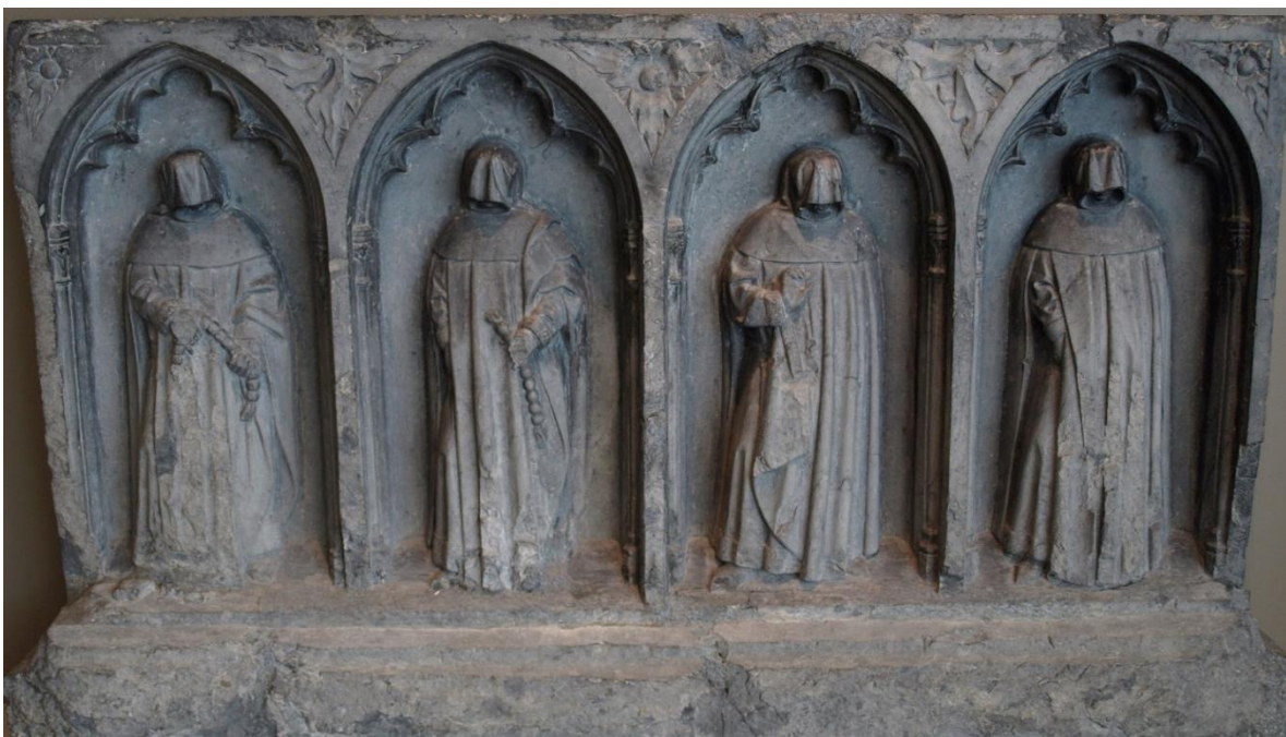
Figure 3-12. Tomb Relief of Pierre de Bauffremont, c.1453-72, Walters Art Museum, Baltimore, Maryland.