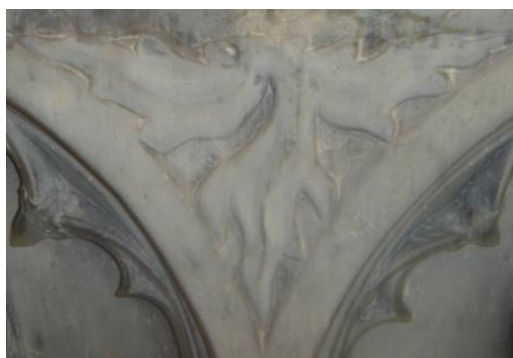
Figure 3-18. Leaf detail, Tomb Relief of Pierre de Bauffremont, c.1453-72, Walters Art Museum, Baltimore, Maryland.