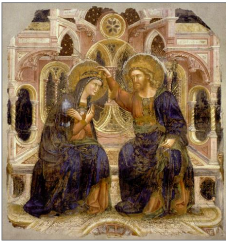
Figure 2-6. Guariento, Coronation of the Virgin , Church of the Eremitani, Padua, c.1351 (originally Sant'Agostino).