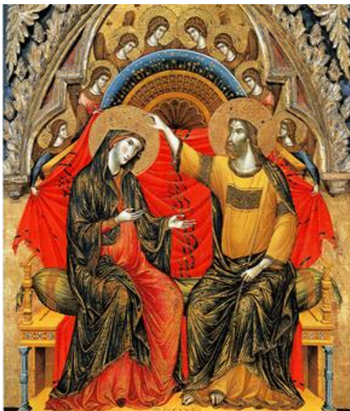
Figure 2-3. Paolo Veneziano, Coronation of the Virgin , 1324. National Gallery of Art, Washington.