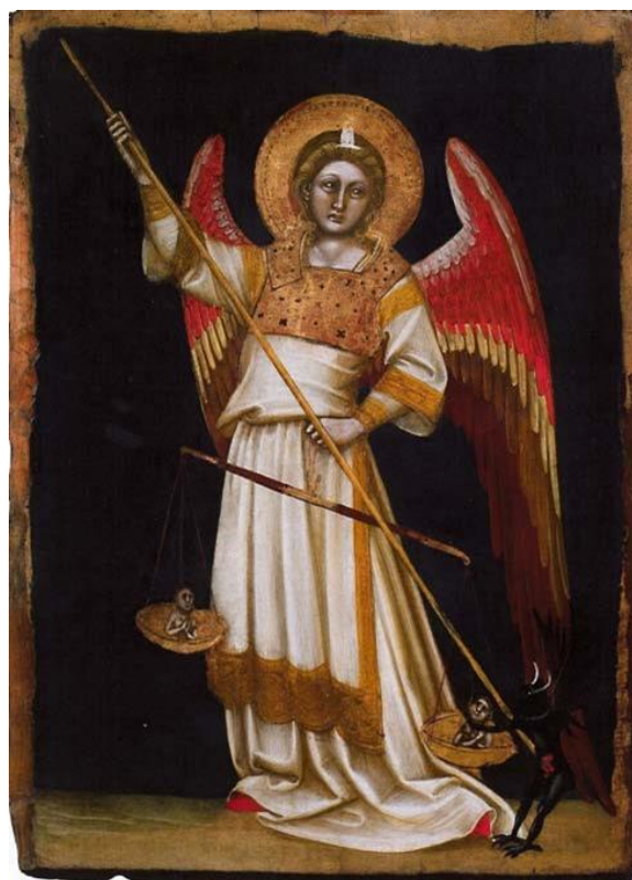
Figure 2-16. Guariento, Angel Weighing Soul and Fighting with the Devil (Dominions) , c. 1347-50, Musei Civici, Padua (formerly chapel of the Reggia Carrara).