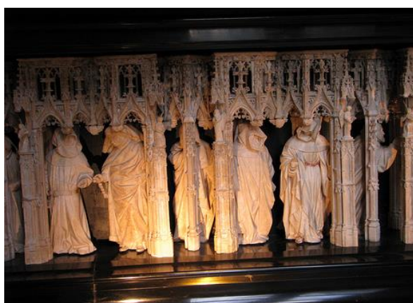
Figure 3-4. Mourners, Tomb of Philip the Bold, Duke of Burgundy, c.1381-1410 (Musée des Beaux-Arts, Dijon).