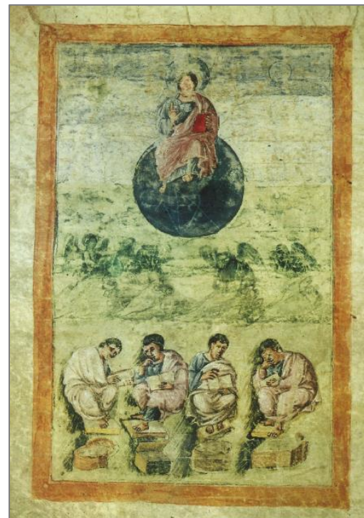
Figure 1-3. Majestas Domini, Xanten Gospels, c. 810.