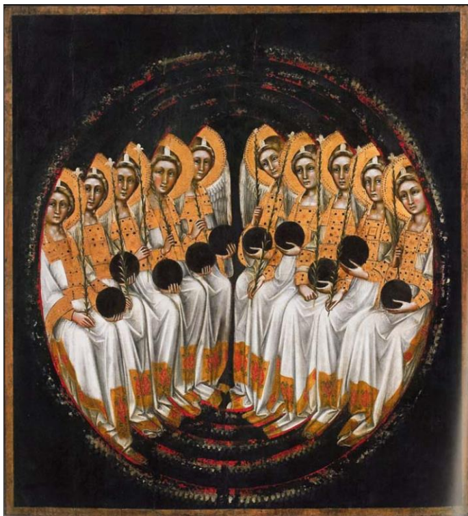
Figure 2-13. Guariento, Seraphim , c.1347-50, Museo Civici, Padua (formerly chapel of the Reggia Carrara).