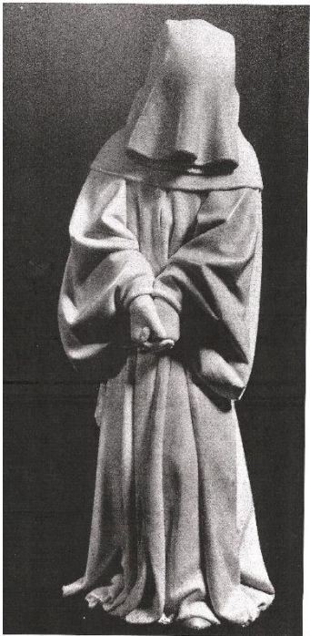
Figure 3-10. Mourner, Tomb of John the Fearless, Duke of Burgundy, c.1443-1469