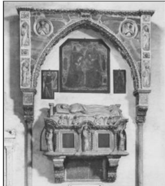
Figure 2-5. Tomb of Giacomo II da Carrara as it appeared in the church of Sant'Agostino, Padua. Guariento's Coronation of the Virgin , c.1351, originally hung above the effigy of the deceased.