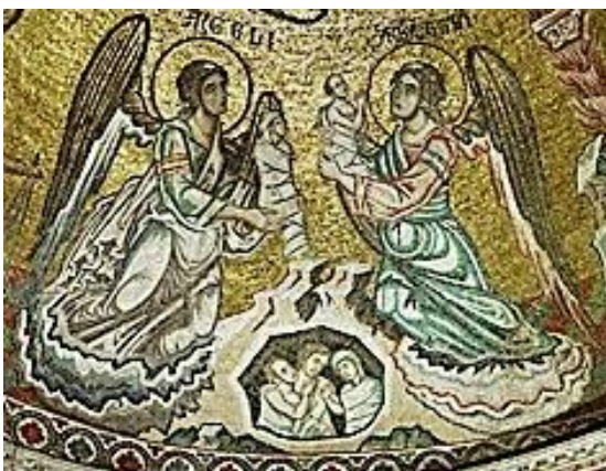
Figure 2-11. Angeli and Arkangelo , Dome of the Angels of the Baptistery, San Marco, Venice, mid-1300s.