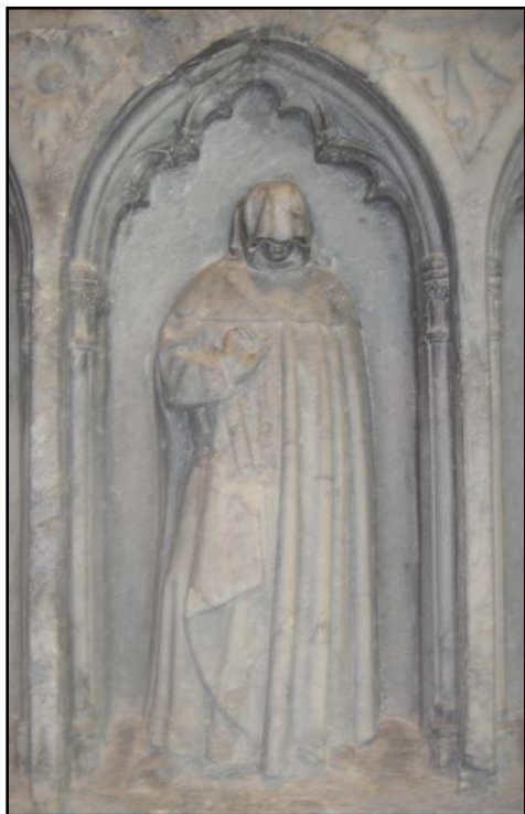
Figure 3-15. Mourner, Tomb Relief of Pierre de Bauffremont, c.1453-72, Walters Art Museum, Baltimore, Maryland.