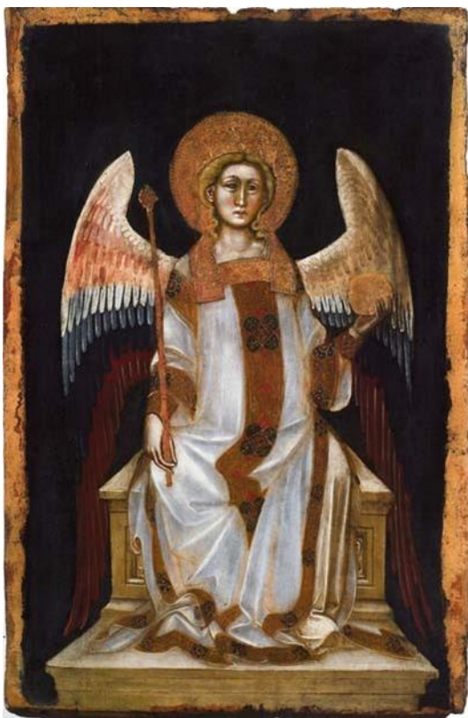
Figure 2-15. Guariento, Sitting Angel Crowned with Scepter and Orb (Thrones) , c.1347-50, Musei Civici, Padua (formerly chapel of the Reggia Carrara).