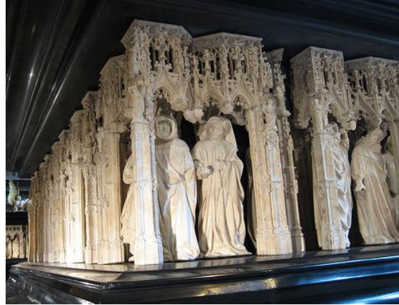
Figure 3-9. Mourners, Tomb of John the Fearless, Duke of Burgundy, Musée des Beaux-Arts, Dijon, c.1443-1469.