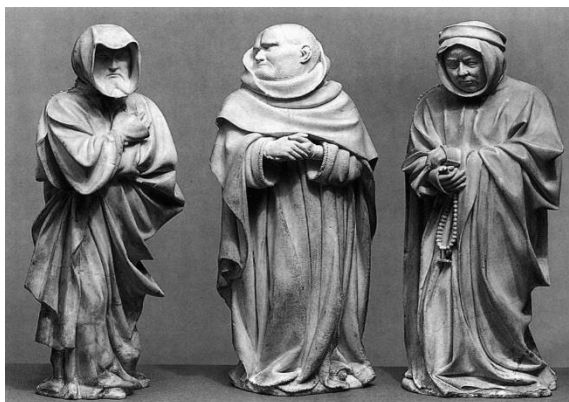
Figure 3-6. Mourners, Tomb of Philip the Bold, Duke of Burgundy, c.1381-1410 (Musée des Beaux-Arts, Dijon).