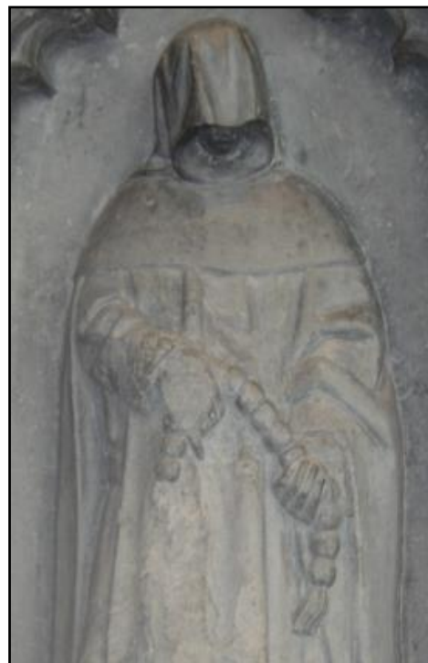
Figure 3-16. Mourner with Rosary, Tomb Relief of Pierre de Bauffremont, c.1453-72, Walters Art Museum, Baltimore, Maryland.