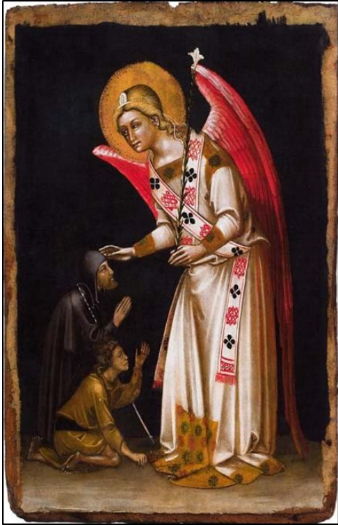
Figure 2-17. Guariento, Angel with Lily Who Helps a Stranger and Lame Man (Virtue) , c.1347-50, Musei Civici, Padua (formerly chapel of the Reggia Carrara).