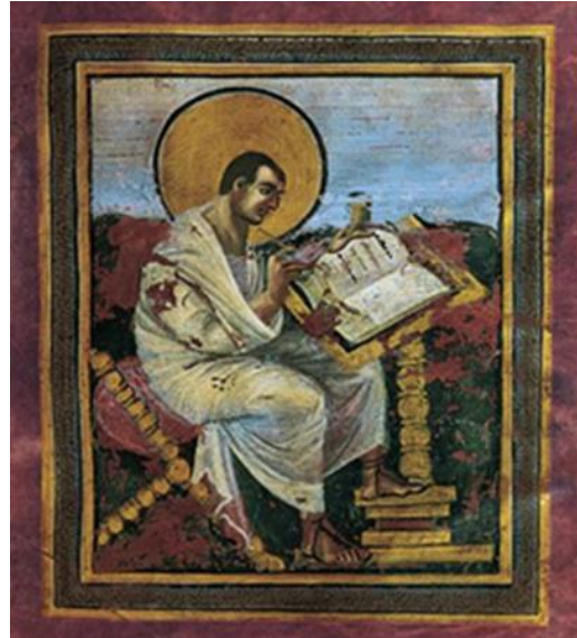
Figure 1-5. Saint Matthew, Coronation Gospels, c.800, Vienna.