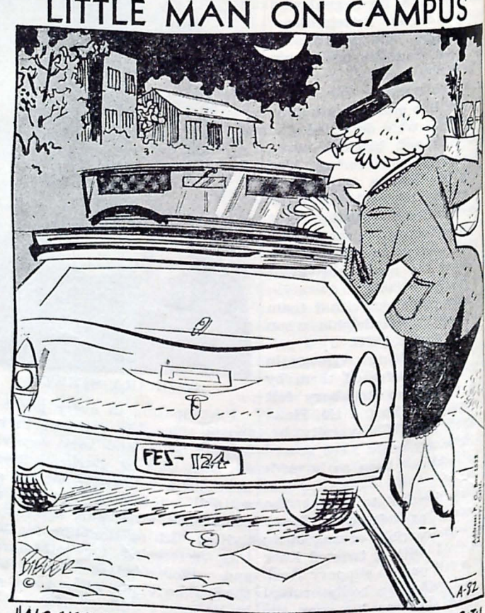
NO WONDER TH' RUSSIANS ARE AHEAD OF US YOU SHOULD BE IN THE LIBRARY STUDYING,