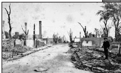
The 1886 Fire of Salisbury