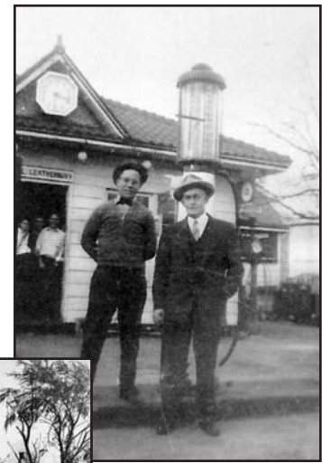
Mardela Springs – Main Street at the Mid-Century