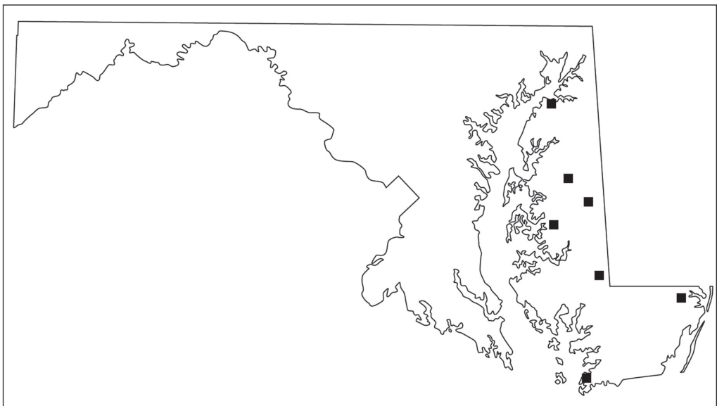
Figure 1. Location of 7 forests along Maryland's Coastal Plain region. Site locations are listed north to south in Table 1.

In order to examine dung beetle species richness and abundance, we used 200-m linear transects, with human-dung–baited pitfall traps (Larsen and Forsyth 2005), set every 50 m (5 total for each site). Human dung is among the most attractive baits to most species of coprophagous beetles (Howden and Nealis 1975) and is a readily available resource. Traps consisted of a 2.4-L (2.5-qt) plastic container (16 cm diameter, 15 cm depth) buried in the soil, flush to the rim. We hung mixed human dung, wrapped in cheesecloth and tied with biodegradable twine, from mesh chicken wire placed over the bucket. We placed a 20 cm x 20 cm plywood tile at a 45° angle above the trap to prevent rainwater flooding. We added a small amount of water and table salt to the bottom of each bucket to preserve the specimens until collection. We baited the traps once a month (May 2014–April 2015) for a 7-d period. We placed all collected beetles in 75% ethanol and returned to the lab for sorting and identification. We calculated estimated species richness (Chao1, ICE, and ACE richness metrics) in EstimateS version 9.1.0 software (Colwell 2013). We created species-accumulation curves to illustrate the rate at which new species were sampled and examined rarefaction curves to compare species richness among the 7 forests (Gotelli and Colwell 2001). We examined species diversity using the Shannon exponential mean ( e^H ) and Simpson's index ( 1/D ).