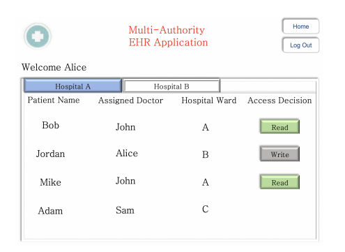
Fig. 2: Prototype User Interface

Evaluation. For evaluation of our system, we developed a proof of concept prototype that is described below. Suppose an EHR of a patient Bob is enforced and encrypted by our framework under the an organization's access policy. If any user is able to qualify the access policy then read access decision is provided by Access Handler module. Suppose Alice is an authorized user and her attributes match against Bob's EHR access policy, then after singing into our system, a "read" access decision is provided by Access Handler Module of our framework. Figure 2 depicts the prototype user interface of our system for a user Alice after signing into our system. Access decisions are provided by matching the access policies against attributes of the user.