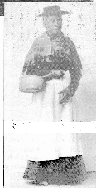
20 Still Searching For Aunt Dilly