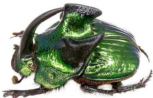
Phanaeus demon

Research Interests: I am an organismal biologist trained in entomology, ecology, evolution, and systematics. My PhD work focused on the phylogenetics of the New World dung beetle genus Phanaeus . The genus is a beautiful group of dung beetles with bright colors ranging from red to maroon, to blue, green and black (See photos to the left). They feed mainly on mammalian dung, but some are attracted to carrion and mushrooms.