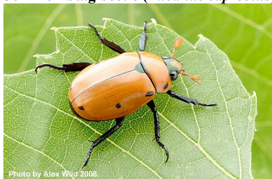
Grapevine beetle ( Pelidnota punctata )