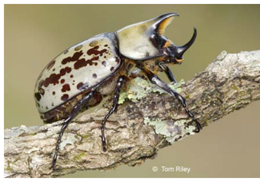
Eastern Hercules Beetle ( Dynastes tityus )