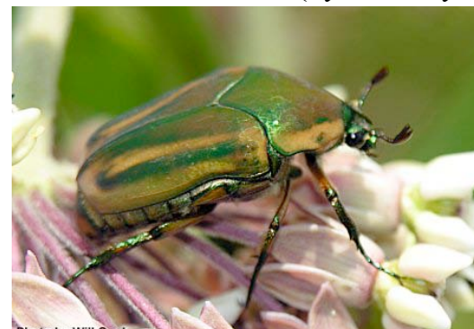
Green June beetle ( Cotinis nitida )