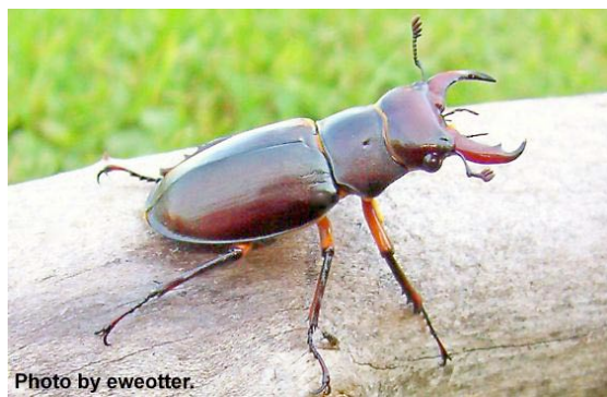
Common Stag beetle ( Lucanus capreolus )

On a larger scale, I am working with students to begin collections of all Scarabaeoid beetles in each of the 23 counties of Maryland with an emphasis on the Eastern Shore. Collection materials will be further supplemented with historical records from museum collections, USDA holdings, and personal collections from Maryland. Data accumulated from this project will ultimately be used to create a taxonomic guide to the Scarabaeoidea of Maryland. SU Biology undergraduate and graduate students, SU Alumni, Maryland Naturalists, and individuals that have a general interest in beetle collection are participating in the collection of beetles across Maryland's diverse terrain. If you are interested in conducting beetle research or would like to participate in the collection of Scarab beetles, please contact Dr. Price ( dlprice@salisbury.edu ). Below are four "Scarabs" collected from Wicomico County.