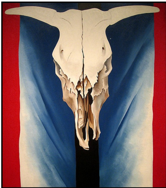
Figure 2. Georgia O'Keeffe, Cow Skull—Red, White and Blue , 1931.