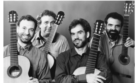
Brazilian Guitar Quartet