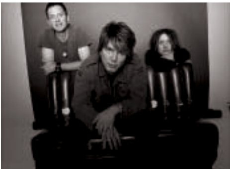
The Goo Goo Dolls

The alternative rock superstars the Goo Goo Dolls will appear in concert at FSU's Cordts Physical Education Center Main Arena on Sunday, April 22, at 8 p.m. Tickets are available at the FSU Lane University Center Box Office and online at http://ces.frostburg.edu .