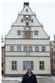
Brady Gaumer in Germany – Intersession 2019

FSU students have the opportunity to study abroad all over the world.