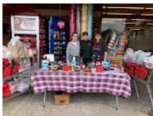
Food drive before March 30, left, and food drive after

On Saturday, March 30, representatives from FSU's Sustainability Studies Minor and Food Recovery Network held a food drive at Weis in Frostburg. Between 9:30 a.m. and 2:30 p.m., students collected $311.25 and 411.3 lbs. of food for PAWS Pantry.