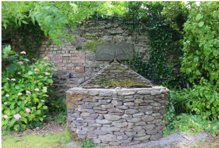
Tobar nano, a holy well located on the property of a convent in Dingle.

where fresh and salt water met designated for cures for barrenness (O Giollain, 2005). Rosari Kingston has also researched the use of holy wells by traditional Irish healers, who often placed the wounded within these wells and utilized herbal washes and incantations to cure (Kingston, 2009). The Irish tradition of pilgrimages to sacred sites was ancient, so as the wave of Catholic change washed over the country, “as long as superstitious practices were not a part of them and...the water’s potency was attributed to the intercession of the saint” the Catholic hierarchy allowed patterns to continue (O Giollain, 36).