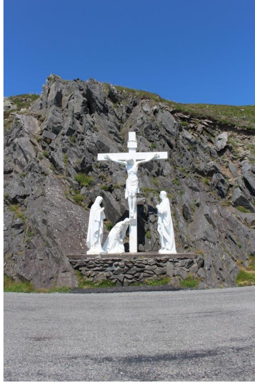
Slea Head's iconic crucifixion monument, overlooking the bay and the historic, abandoned Great Blasket Island.

My investigations in Ireland and the narratives shared here illustrate the country's unique interrelationship and conflict between past and present as its lineage of healers navigate the complexities of proving the efficacy of their healing methodologies. Models that integrate biomedicine and traditional healing are examined, as well as the arguments surrounding these new models of training. As well as the historic healing sites previously mentioned, I visited more structured healing centers where stories of the efforts towards legitimacy and fears of marginalization and a fractured community were shared.