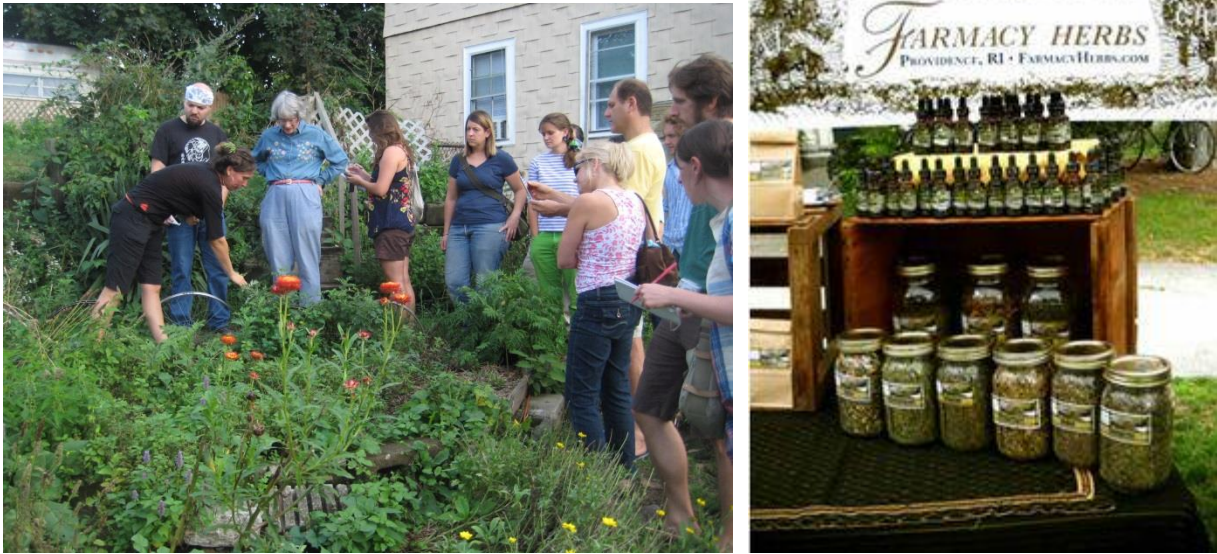
Classes take place at the teaching farm located behind the shop and classroom of Farmacy Herbs (left), and Farmacy Herb's booth at the local Rhode Island Farmers Market (right).