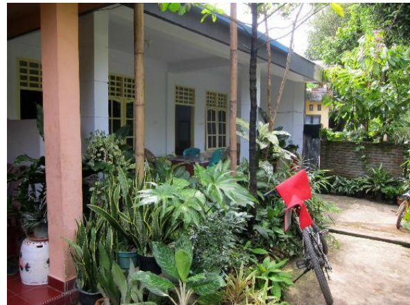
Our home in Rantepao: Riana Homestay.