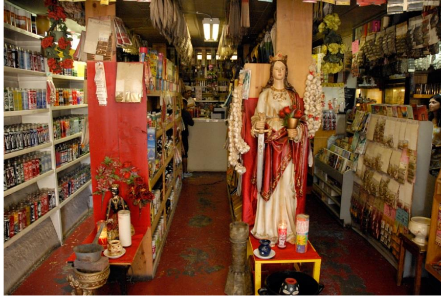
Inside a botanica.