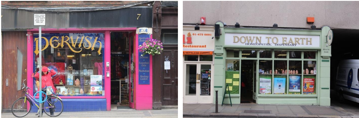
Two homeopathic clinics I stumbled across while exploring Dublin, Ireland.