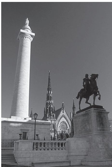
Mt. Vernon Square.

tures actors from the Baltimore/Washington area. It’s half a mile from the Convention Center, and, in late March, will be showing Los Otros , an “unusual kind of musical” that tells the story of one white and one Latino whose lives intertwine.