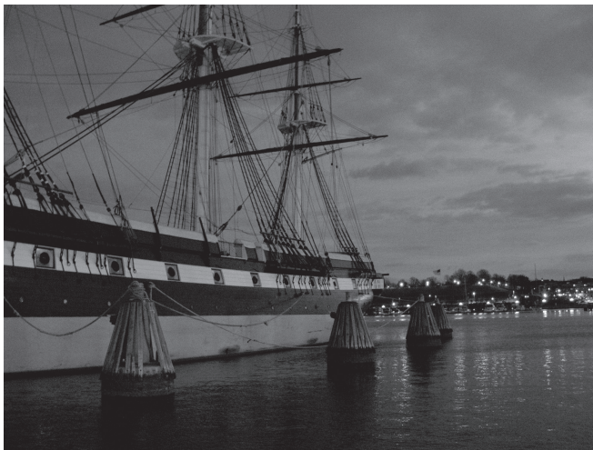
USS Constellation at the Inner Harbor.

• Edgar Allan Poe House (203 N. Amity St., www.poeinbaltimore.org/poe-house/ ). Edgar Allan Poe, famous for his macabre poetry and short stories, spent part of his life in Baltimore, and although he eventually moved to Virginia, it was during a visit back to Baltimore when he mysteriously passed away. He is buried in the Westminster Burying Grounds at Fayette and Greene Streets. The Poe House, which offers an exhibit and tours, is open Friday, Saturday, and Sunday from 11:00 a.m. to 4:00 p.m.