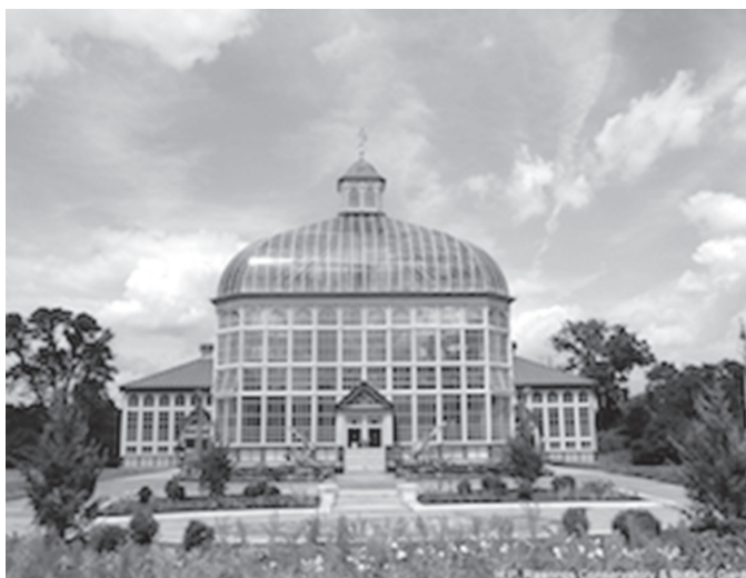
Rawlings Conservatory, Druid Hill Park.

http://bcrp.baltimorecity.gov/parks/federal-hill ) . This park served as defensive grounds during the War of 1812 and the Civil War and now offers recreational space along with breathtaking views of the Inner Harbor.