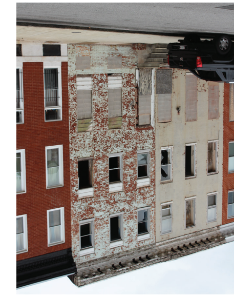
1209 N. Eden Street Baltimore