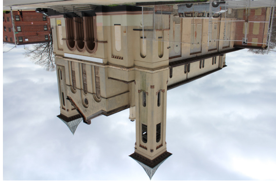
St. Martin de Porres Catholic Church 901 E. Eager Street Baltimore site of Baltimore's free breakfast program beginning in 1969