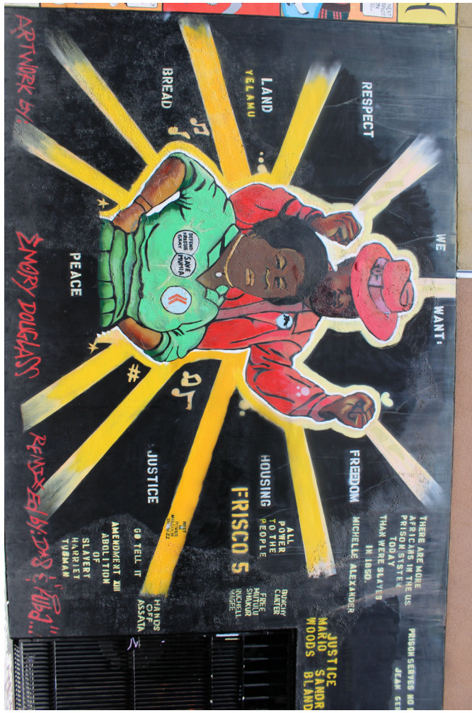
art: Emory Douglas

Baltimore Black Panther women, like their national counterparts, were central actors in Cedric Robinson's Black radical tradition because of their centrality to the everyday operations of the survival programs. In their capacity as formal leaders and rank-and-file members, they carved out space and self-determination in their communities to constantly enact revolution. Their navigation of race, gender, class, and motherhood in practice, demonstrated that the Black woman, subjugated by race, gender, and class, was indeed the vanguard of the revolution.