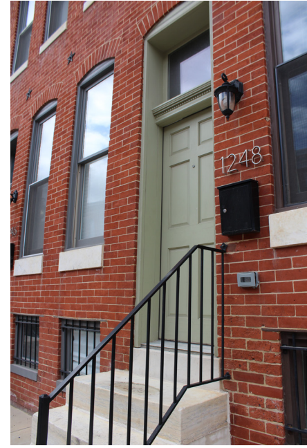
1248 N. Gay Street Baltimore