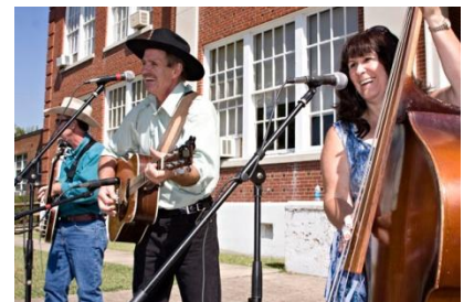
Bear Hill Bluegrass

A benefit concert for WFWM Public Radio will be held Nov. 19 at the Bottling Works on Main Street in Romney, W.Va. Doors will open at 7 p.m. and the concert will start at 7:30 p.m.