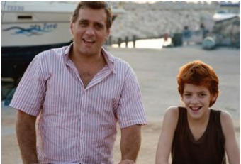
A Scene From “Eli and Ben”

FSU continues the Fourth Annual Bridges to the World International Film Festival with a film from Israel, “Eli and Ben,” on Tuesday, Feb. 19 , at 7 p.m. in Lane 111. “Eli and Ben” offers a touching coming-of-age drama by weaving together two complementary stories: Eli’s recognition that his father (Ben) is fallible and negotiating the daily politics of school. Both stories address themes of peer pressure, corruption, disillusionment, deceit, faith, justice, friendship, personal ethics and social responsibility. As Eli faces a series of crises, he discovers new strength in himself and learns that growing up and entering the real world require sacrifice.