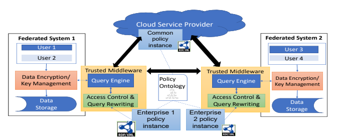
Figure 1. System Architecture

Figure 1 illustrates the overall architecture of our proposed system, which consists of federated members, their own storage infrastructure, and users. Data-as-a-Service is implemented in our architecture as a middleware layer. We use an existing web-based RDF storage and query interface (Apache Jena Fuseki) and use query rewriting to add situation-aware access control. We first develop an ontology to represent access control rules for each member. These rules can be stored at each member or, the rules common to all members can be stored in the cloud to allow every member to have access. Next, we go over the key components in our system.