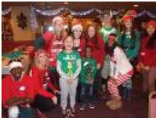
Santa’s elves pose with Storybook Holiday participants.

Storybook Holiday will be held on Saturday, Dec. 3 , in downtown Frostburg. There are multiple time slots for each job at Storybook Holiday; the volunteer slots are listed in chronological order. You will need to be at your job 30 minutes before the job starts to sign in. Include your name and email address so you can be contacted with information before the event, and text @sbh2016 to 81010 to receive text updates the day of the event. Your personal number will not be used for anything else, and it is not shared. When signing up, be sure your jobs do not overlap times.