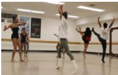
Members of the FSU Dance Company rehearse for their upcoming production.

FSU's Department of Theatre and Dance will debut a unique dance concert on Thursday, Nov. 10, through Saturday, Nov. 12 , in the F. Perry Smith Studio Theatre of the Performing Arts Center. Audience members will get two for the price of one as the FSU Dance Company presents two concerts in one evening. Performances begin at 7:30 p.m. on Nov. 10 and 11 , with a matinee suited for a lunch before, or dinner after, on Nov. 12 at 3 p.m.