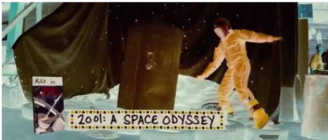
Figure 2: Mike and Jerry’s 2001: A Space Odyssey in Be Kind Rewind (screen capture)

ultimate expression of film nostalgia in the age of digital cinema,” according to Sperb. 16 In Gondry’s film, a pair of video store workers, Mike (Mos Def) and Jerry (Jack Black) must remake movies like Ghostbusters (1984), Rush Hour 2 (2001), The Lion King (1994), and Robocop (1987) after a freak accident wipes out all of the store’s VHS tapes. Hamstrung by shoestring budgets and tight schedules, Mike and Jerry seek to reduce each film to its essence—to a couple of iconic lines or shots—as in a sequence in which the pair tackle films ranging from When We Were Kings (1996) to 2001: A Space Odyssey (1968) to King Kong (1933); Mike recreates David Bowman’s psychedelic encounter with the Monolith in Kubrick’s classic by traipsing towards a small refrigerator filmed in negative, the tires under his feet meant to represent the craters of a planet. Jerry and Mike’s project not only reflects the curatorial bent of 8-Bit Cinema but its nostalgic impulse as well. Sperb’s description of the film as a “powerful meditation not only on what gets left behind during periods of innovation and transition but on the dangers of being obsessed with constant progress and newness for their own sake” 17 could just as well apply to 8-Bit’s modus operandi of making the new look old, the old look old, or the old look older: oldness for its own sake, or for ours.