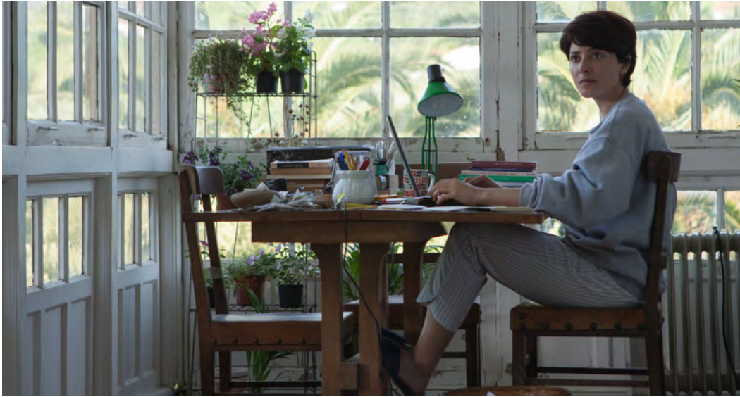
Frida Films ( María (and Everybody Else) , 2016)