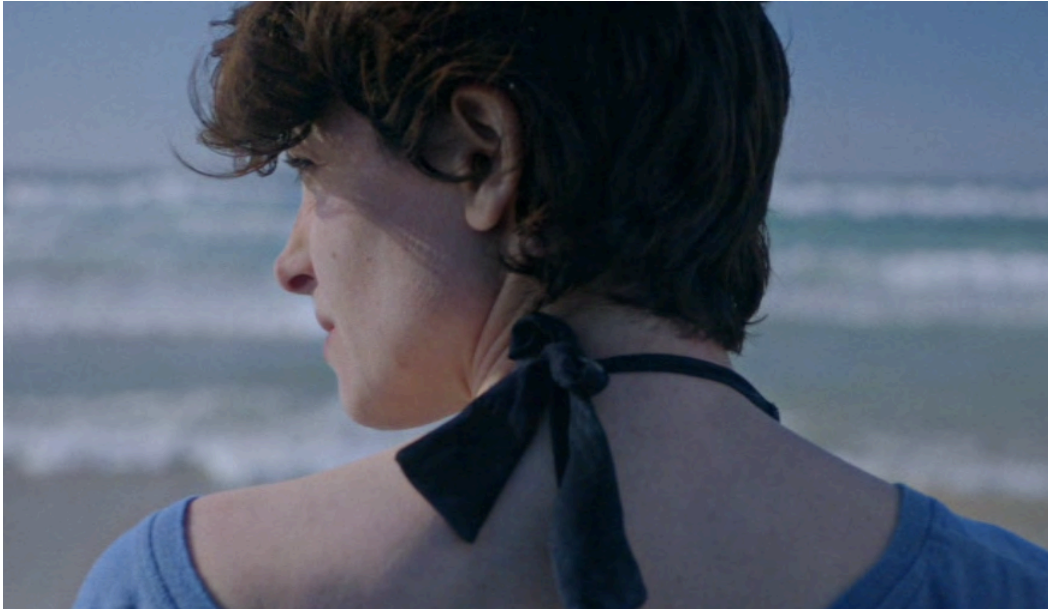
Frida Films ( María (and Everybody Else) , 2016)

with women in my films because many of them are also a part of my circle of friends. Independent of this, for such a woman-centered film like María (and Everybody Else) I always wanted to work with female (and male) screenwriters.