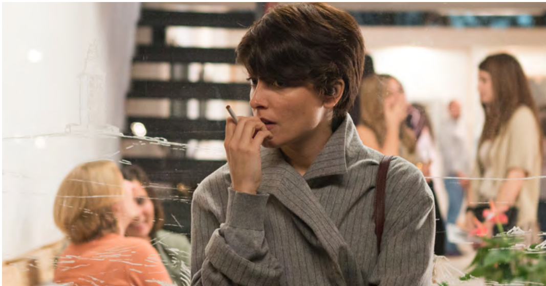
Frida Films ( María (and Everybody Else) , 2016)