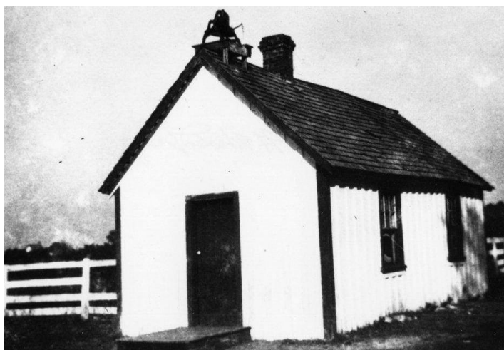
Assateague Village schoolhouse