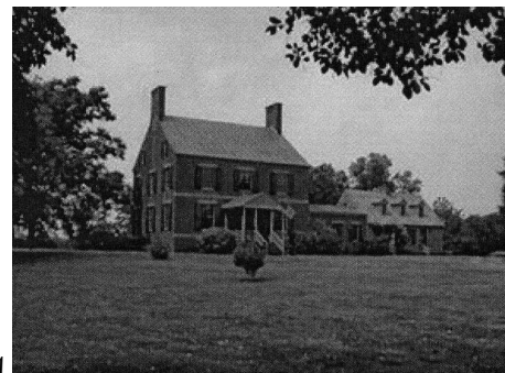
Grapeland, Exmore, VA

Mark your calendars for the Heritage Garden Party at Grapeland, Exmore, VA, on Saturday, May 3, from 4:30-7:30 p.m. For information, call 410-543-6312.