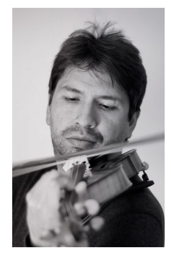
Saturday, October 15 Holloway Hall Auditorium • 7:30 p.m.