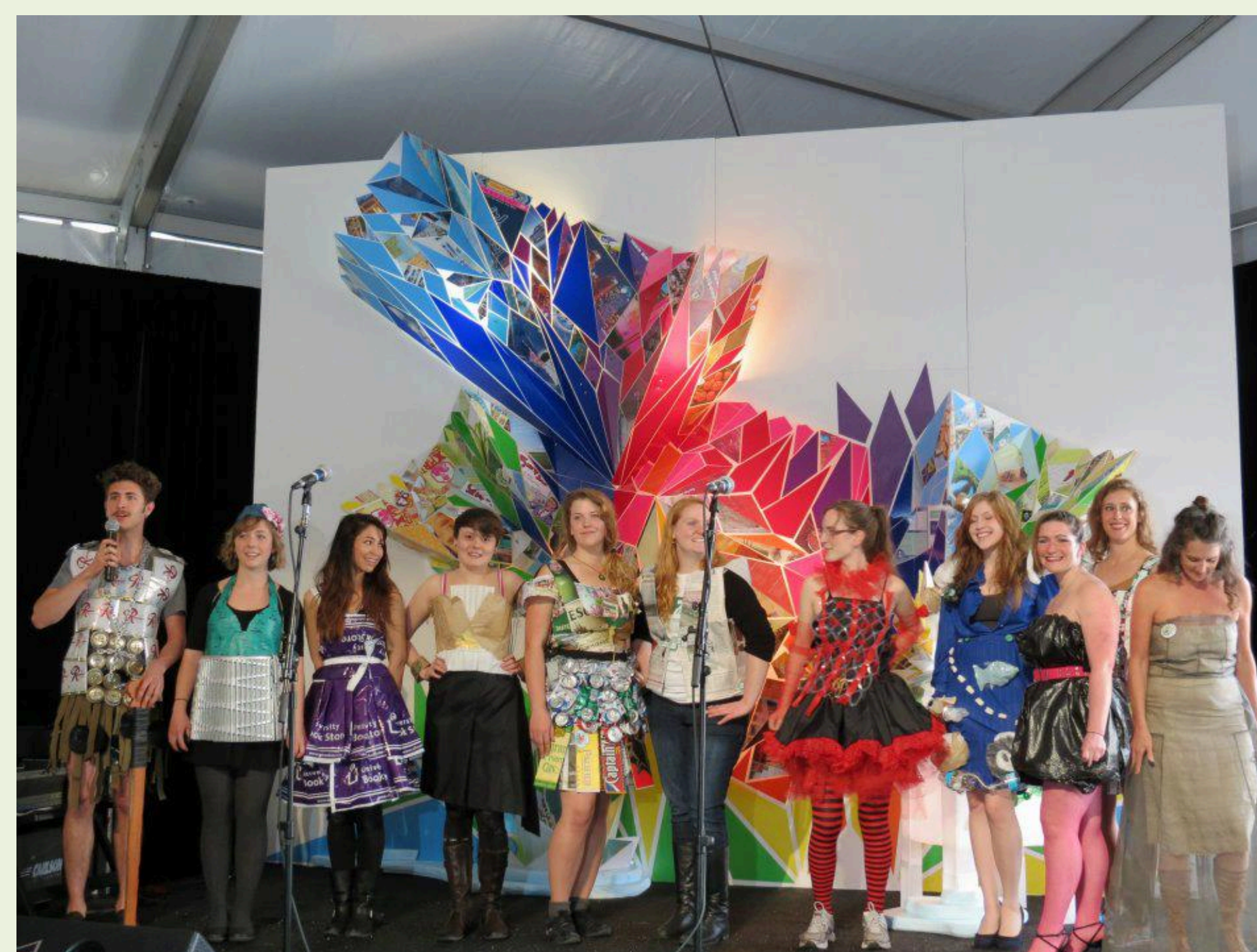
Eco-Reps maintain campus visibility by organizing "Trashion Shows" where contestants make fashion out of waste