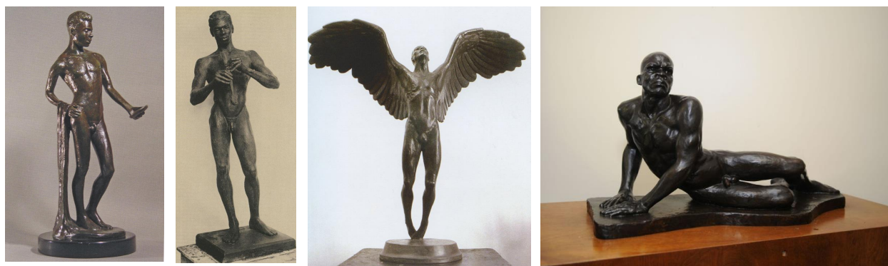
Figs. 1–4. Left to Right: Richmond Barthé, Black Narcissus , 1929. Bronze, 19 ½ inches high. Courtesy Childs Gallery, Boston; Richmond Barthé, Boy with a Flute , 1939. Plaster, life size. Destroyed about 1942; Richmond Barthé, Fallen Aviator , 1945. Bronze, 18 ¾ in. high. Collection of Tuskegee Institute, Tuskegee, Alabama; Richmond Barthé, Africa Awakening , 1959. Bronze, 27 x 15 ½ x 10 ½ in. Museum of Art, University of Southern Mississippi, Hattiesburg

James Richmond Barthé (1901–1989) is unique among so-called New Negro artists in that his works focus primarily on the male form in all its classicizing and modernizing masculine glory as a way to explore nuances of what concerned him most: his race, his spiritual sense, his homosexuality, and his class. Barthé’s male nudes became the material and aesthetic terrain through which he attempted to work out and work through the intricacies and complications of these issues. Classical themes and the cultural weight that came with them were a means through which he attempted to resolve the inherent conflicts among these intricate topics. He exploits the black male body as a site for aesthetic, political, cultural, and erotic critique while also directing attention to the potentially transformative aesthetic and political roles of race and homoeroticism through classical themes. He does not quote classical sources directly but instead lights upon their motifs or allusions, incorporating into them those just-mentioned themes rendered through the male nude body at rest or in motion.