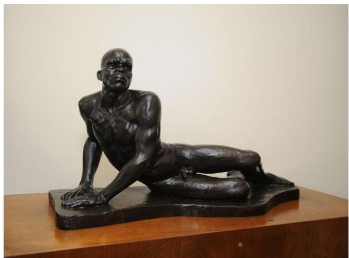
Fig. 4. Richmond Barthé, Africa Awakening , 1959. Bronze, 27 x 15 ½ x 10 ½ in. Museum of Art, University of Southern Mississippi, Hattiesburg

Throughout much of the 1940s, there was a creative and financial lull in Barthé’s career. In 1949, he decided to move from New York City to Jamaica. There, he purchased a house with some adjacent land in the small village of Colgate. Proof of his continued enthusiasm in using classicism as expressive camouflage for his homoerotic interests is seen in the name he chose to give to his new domestic headquarters—Iolaus—the name associated with the nephew, lover, and charioteer of the brawny god Heracles (Hercules) and the title of Edward Carpenter’s 1917 anthology devoted to