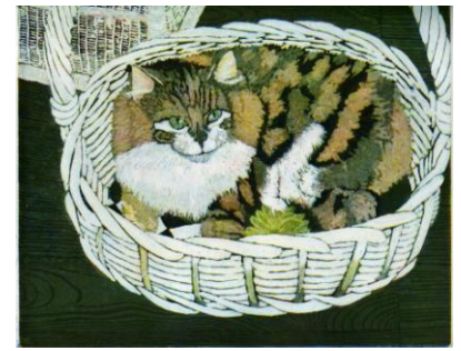
"Miss Sophy" by Shirley Tabler; aquatint etching

The Roper Gallery is open Sunday through Wednesday from 1 to 4 p.m. For info, call the Department of Visual Arts at x4797.