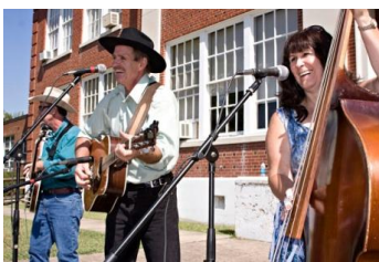
Bear Hill Bluegrass

A benefit concert for WFWM Public Radio will be held Saturday, Nov. 19 , at the Bottling Works on Main Street in Romney, W.Va. Doors will open at 7 p.m. and the concert will start at 7:30 p.m.