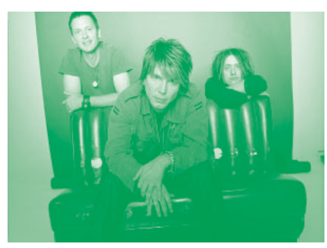
The Goo Goo Dolls

He decided to pack up and head back East, meeting bandmates Takac and drummer Mike Malinin in Buffalo to set up shop in a 100-year-old Masonic Ballroom.