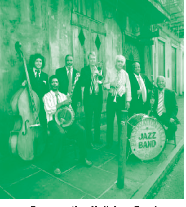
Preservation Hall Jazz Band