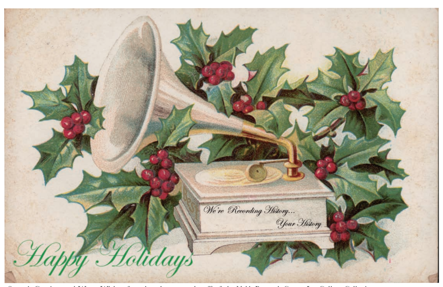
Season's Greetings and Warm Wishes, from the volunteers and staff of the Nabb Research Center. Les Callette Collection.