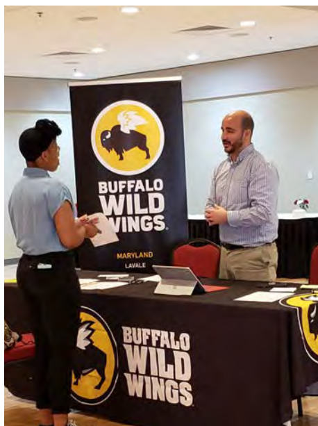
A representative from Buffalo Wild Wings explains the internships he has available.