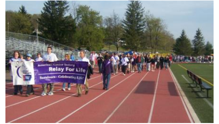
The first lap of Relay for Life, which honors cancer survivors

With 68 teams, 883 registered participants and more than 1,000 people in attendance, FSU’s Relay for Life event has raised $43,680 as of May 5. The two-day event was held April 23 and 24. Monies raised will support the American Cancer Society with cancer research and possibly finding a cure.