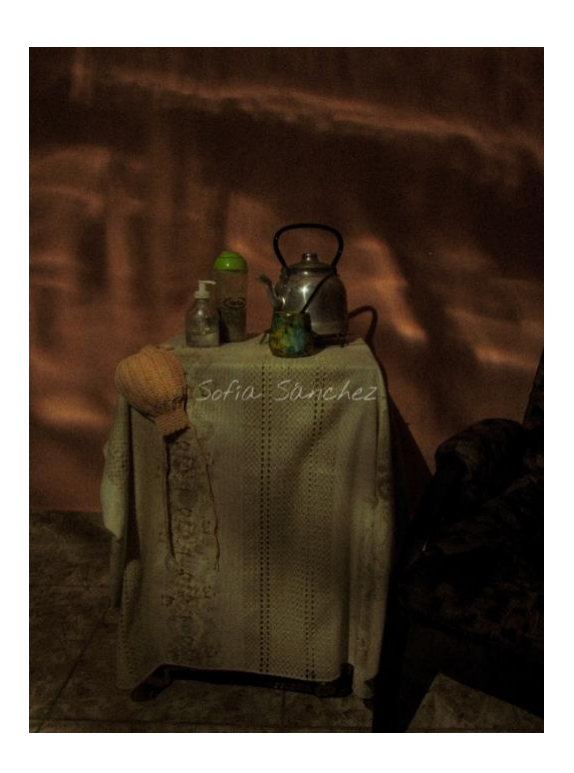
Figure 3. Coping with discomforting emotions using photography.

Source. The student is an amateur photographer and added her name to the photo as a watermark, askingthat her real name be included in any publication.