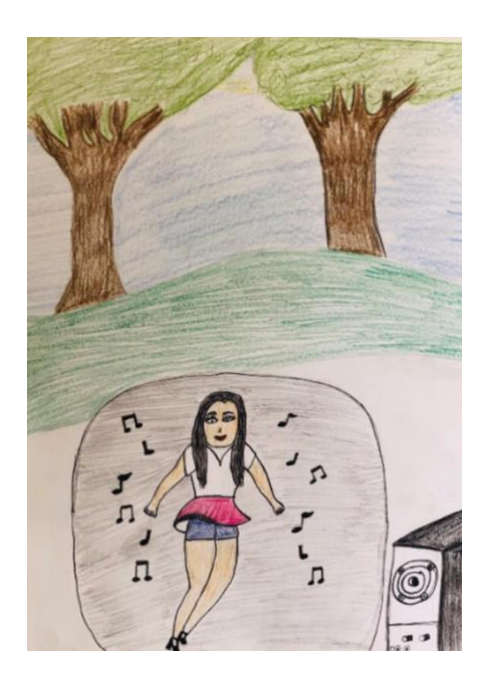
Figure 2. Channelling discomforting emotions artistically to foster hope.

those emotions, fostered hope and allowed the personal transformation ('comfort and peace') using drawing, dancing and music. [page 11 ends here]