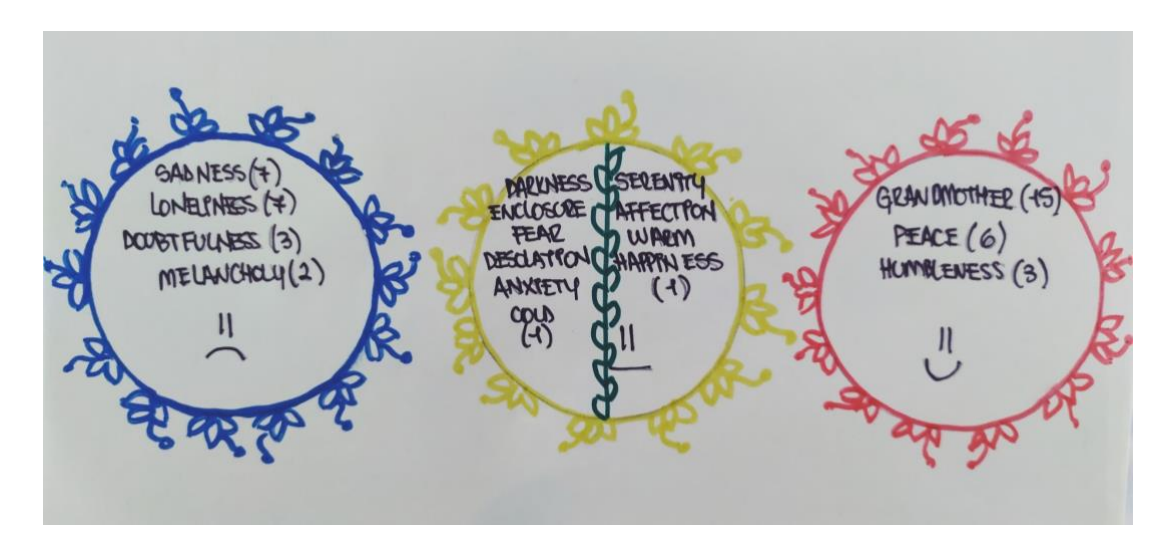
Figure 5. Graphic representation of impact of social action

In the group report of their action stage, they explained the artistic decisions around the use of colours: