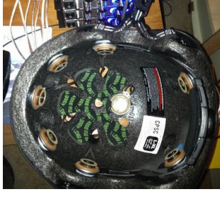
Figure 2. The outside and inside of the current headmounted tactile device prototype [7].

that the design of a head-mounted device had to reconcile with social concerns, such as not being so noisy or visually conspicuous as to draw unwanted attention. In this regard, the inclusion of the experience and perspectives of numerous participants supported a broad and thoughtful consideration of the prototype design and the goal of collecting ideas for conveying, via the sense of touch, that which would otherwise be difficult to convey. The groups also agreed that a headmounted system, when presenting spatial alerts, should account for the lateral and forward extension and flexion and longitudinal rotation of the head about the neck, relative to the vector of the approaching threat. The groups also differed on several conclusions. The second group prioritized the need to allow customization of tactile cues on any device, while the third group (citing their own experience with mobile technology) prioritized the need for optimal "out of the box" performance.