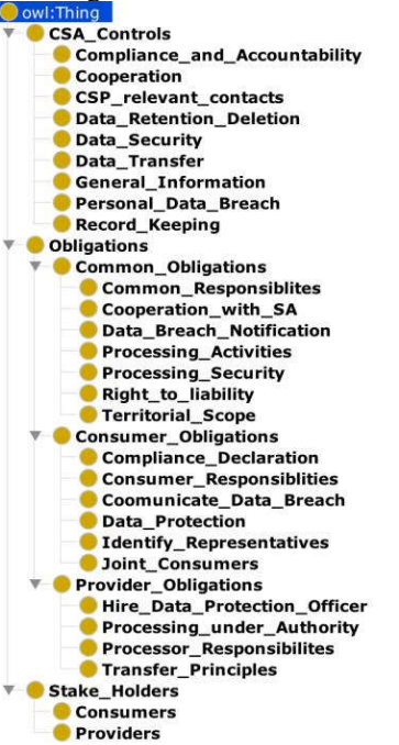
Figure 2: Sub Classes for GDPR Obligations Vs CSA Controls

As part of our future work, we will be expanding the knowledge graph by associating various country obligations with standard CSA controls. With that end users can use this knowledge graph to determine all the obligations while processing cloud data.