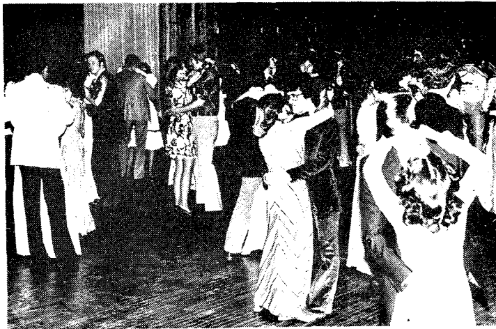
Couples enjoy C.C.B. Valentine's Dance