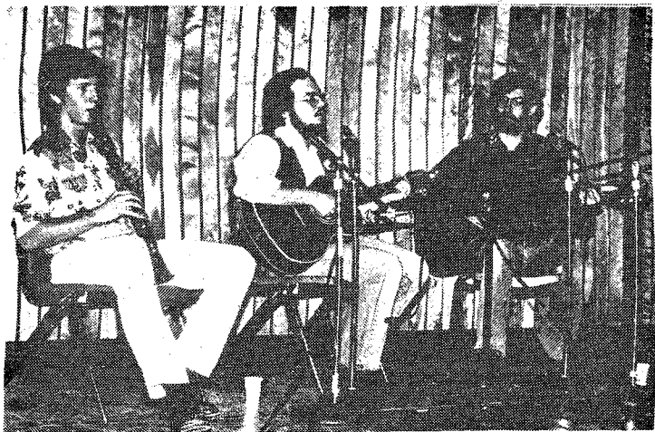
IV Coffeehouse provides entertainment last Saturday night

The Outing Club will hold an important meeting on Monday, February 20 at 7:00 p.m. in the Library, Room 210. (Must enter from the outside.)