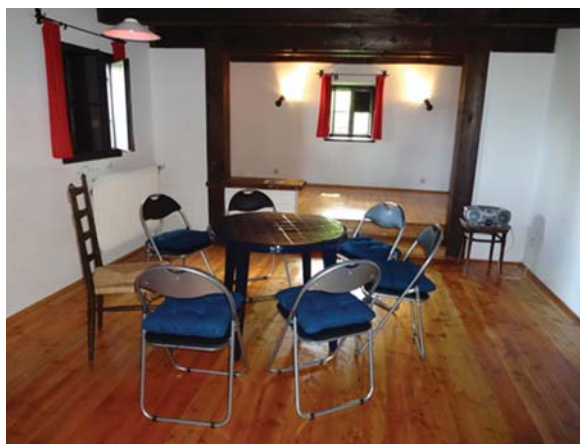
Figure 4. Farmhouse séance room.

was documented on video. Sitters again removed all rings and watches. I wore no shoes, which allowed a more sensitive method of controlling Kai's left foot. The sitters were vigilant throughout to remain in touch with their neighbors' hands and legs. In fact, because Julia was too far from Robert for normal control,