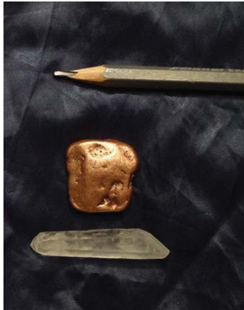
Figure 2. Apport #1, crystal (bottom) Apport #2, copper nugget (middle) Pencil (top) to show size

Apport #1: Kai stood up and asked Jochen and me to hold his hands. He then asked Julia to shine the flashlight on his mouth. We could clearly see Kai sticking out his tongue and wiggling it, and at one point a 1.75"-long, 3/8"-thick crystal (Figure 2) dropped, loudly and apparently forcibly, onto the table. Probably because Kai had called our attention to his mouth (for the purpose of misdirection?), most sitters had the impression that the