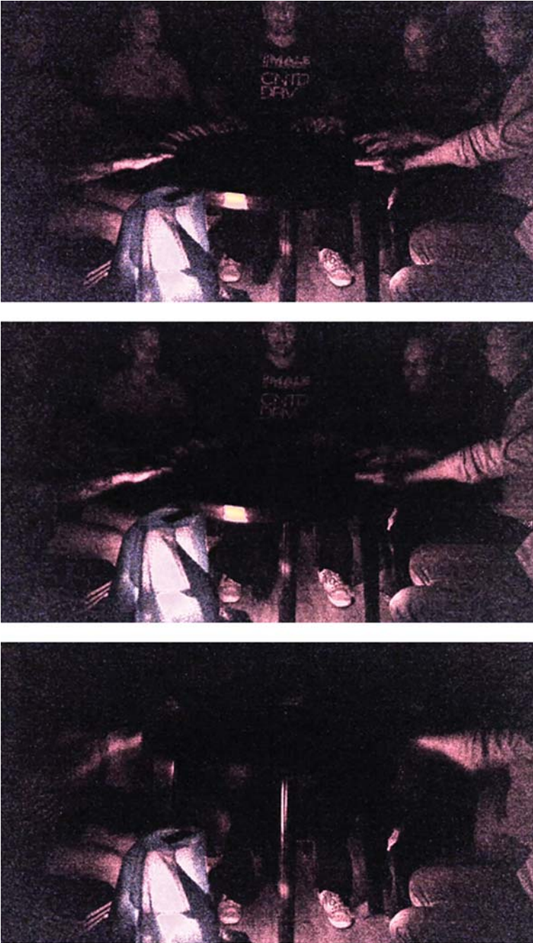
Figure 5. Video stills of table levitation at Séance 05-12-2013.