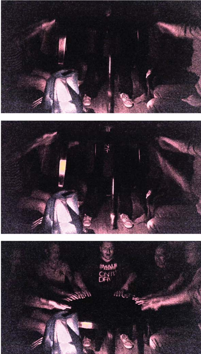
Figure 5. Video stills of table levitation at Séance 05-12-2013 (continued).