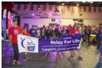
Caregivers for cancer patients take their lap during Frostburg State University’s American Cancer Society Relay for Life on April 29.

Cancer survivors, caregivers and supporters helped raised more than $37,500, passing a goal of $35,000, at the annual FSU Relay For Life held Friday, April 29, in FSU’s Cordts Physical Education Center.