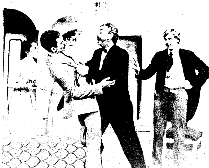
Pictured above and below are scenes from last weekends play production "A Flea in Her Ear." The play was hilarious, as can be seen by the scenes pictured here.

The next SGA meeting will be held October 21st in LC 201 at 8:00 The public is welcome. Sounding Board at 8:30.