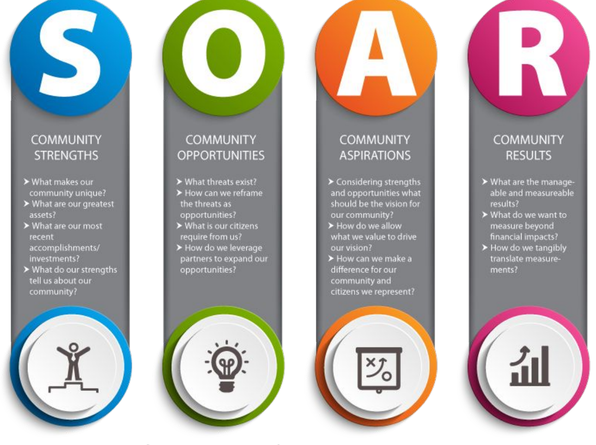
Reflection & Application