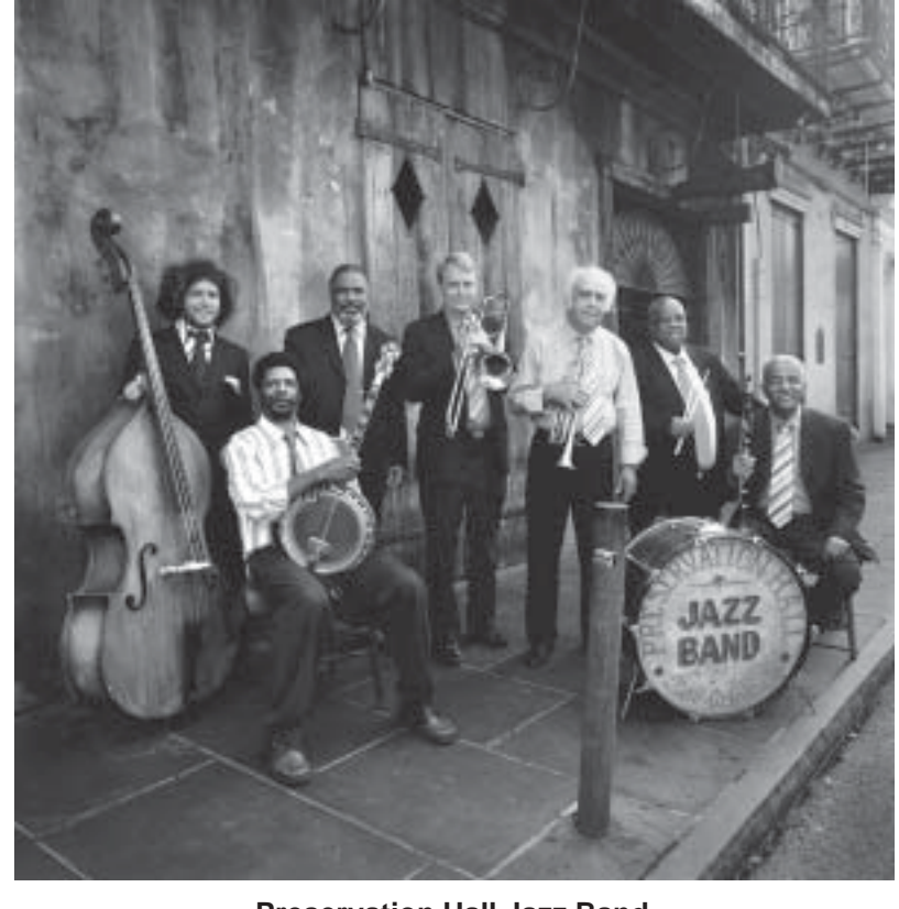
Preservation Hall Jazz Band