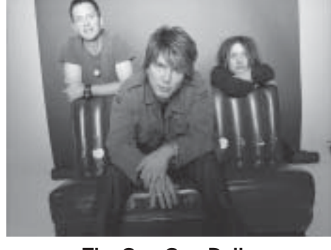
The Goo Goo Dolls

with $18 bleacher seats available to FSU students. For more information, call the Lane University Center Box Office Monday through Friday 9 a.m. to 3 p.m. at x3137 or toll-free at 1-866-TIXX-CES or online at http://ces.frostburg.edu.