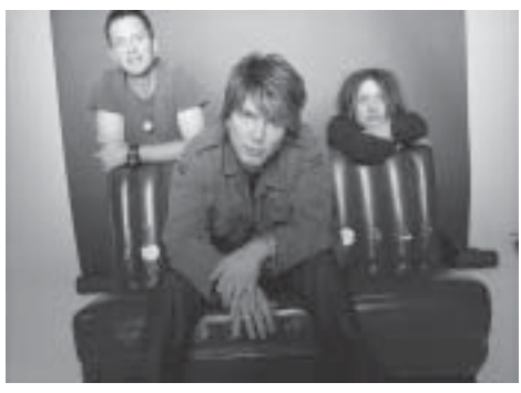
The Goo Goo Dolls

The alternative rock superstars the Goo Goo Dolls will appear in concert at FSU's Cordts Physical Education Center Main Arena on Sunday, April 22, at 8 p.m. Tickets are available at the FSU Lane University Center Box Office and online at http://ces.frostburg.edu.