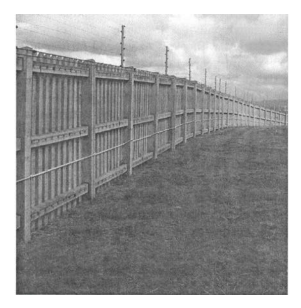
Fig 1 A gated community barrier surrounding Springfield Hills

neighbourhoods refer to residential environments (Landman, 2000a). Of the latter type of residential gated communities there are four that re- search has identified within Durban: (1) the typical fortified apartment block within or immediately adjacent to the city centre, (2) neighbourhoods aspiring to become gated com- munities by soliciting the city of Durban for per- mission to erect boom gates and other security measures on public streets, (3) golf estates found in the suburbs and made up of a number of homes built around a golf course with a unified theme in construction and appearance and (4) the eco-estate which